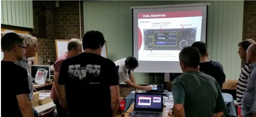
The Icom crew demonstrating.